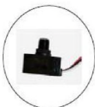
BUTTON STYLE PHOTOCELL 120-277V