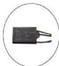
10KV SPD 120-277V