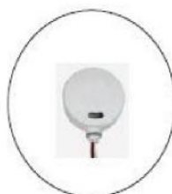
DIMMABLE MOTION SENSOR 120-277V