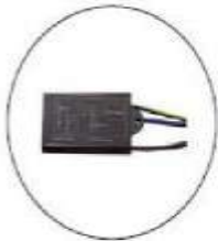
10KV SPD 120-277V