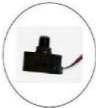
BUTTON STYLE PHOTOCELL 120-277V