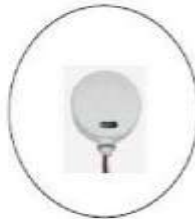
DIMMABLE MOTION SENSOR 120-277V